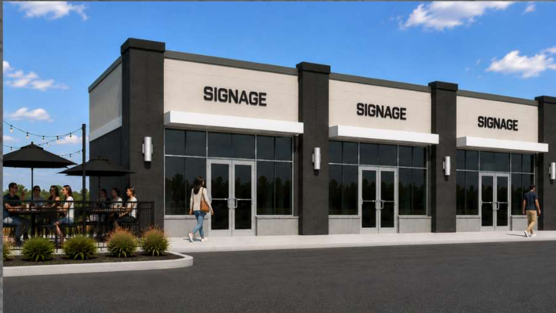
BUILDING A-SIDE B