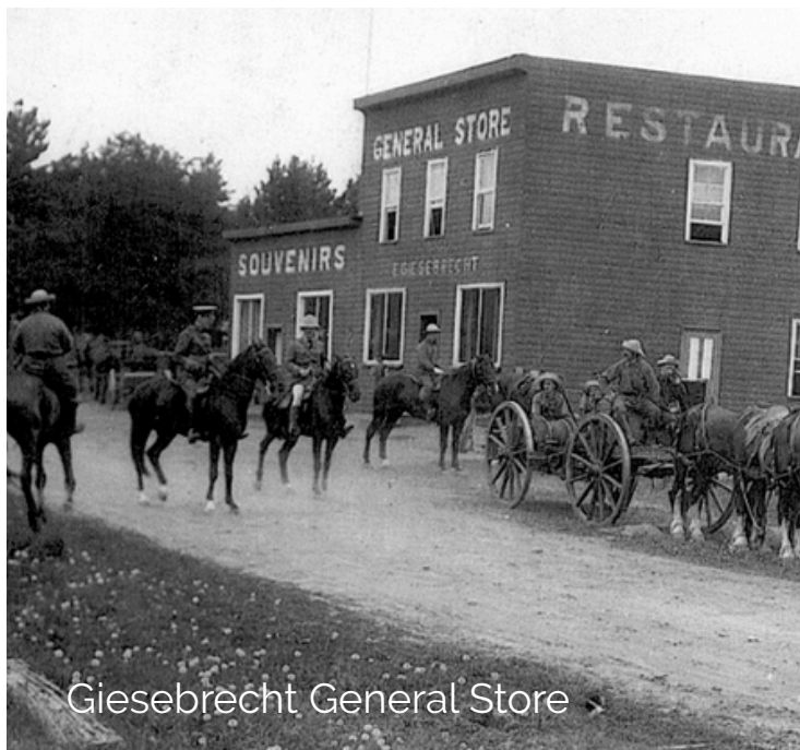
Giesebrecht General Store

-Government of the Province of British Columbia