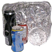
Aluminum cans & plates

Return all eligible liquor, wine, beer containers to the Beer Store for a refund.