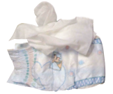
Diapers & diaper wipes