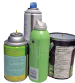
Aerosol (empty) & tin cans