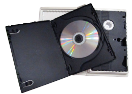
CD/VHS/DVDs & cases