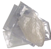
Blister packaging/ bubble-wrap

Garbage can be set out in plastic bags or garbage cans.