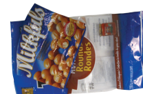
Candy & chip wrappers