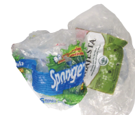
Plastic outer wrap from paper towel, pop, water cases