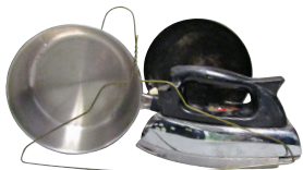
Small scrap metal items - Must fit in your yellow bin - baking sheets, small appliances (i.e. toaster, metal tools, etc.), remove & discard cords in garbage, remove batteries for hazardous waste