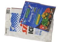
Plastic wood pellet, salt & sand bags (empty)