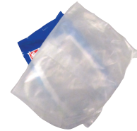
Cereal/cracker box liners & cookie bags