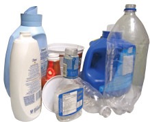
Plastic bottles, jugs, tubs & lids (Empty liquids)