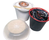
Coffee pods (K-Cups, Tassimo T-discs)