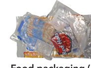
Food packaging (deli meat, hot dog wrappers)